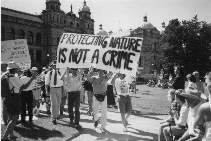
Fig. 1 Demonstration in front of B.C. Parliament Buildings, summer 1993

clear-cut logging in the Clayoquot Sound watershed in 1993. This decision was hotly contested. The conflict culminated in the arrest and conviction for criminal contempt of court of hundreds of people who blocked the logging roads. As such, there was a heavy public interest in the case (Fig.1). To resolve the conflict, the provincial government appointed a Scientific Panel to write a series of reports defining new land-use policies (SPfSFP, 1994-5). The recommendations of this panel were used to partially revise the initial land use decision. However, many claimed that important issues were not adequately addressed in the final version of the reports.