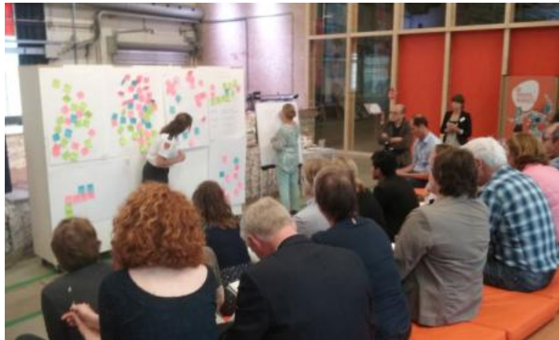
Figure 3: ESIW pre-event #1 plenary session

After the group breakout sessions had been completed, the pre-event continued with a plenary session. A representative of each group presented the cross-overs identified. The audience, in turn, suggested refinements for these cross-overs, new cross-overs, and links between the cross-overs already suggested. At the end of the discussion, an agenda of next actions was also agreed upon, including the idea for an additional joint physical follow-up meeting to work out the proposed cross-overs in more detail, as well as doing this online on the KnowledgeCloud platform.