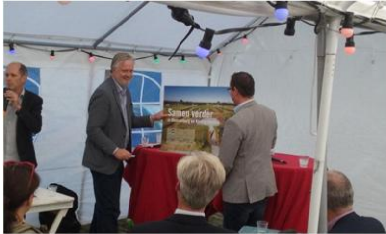
Figure 4: The signing of the symbolic covenant during the Tilburg Water Debate