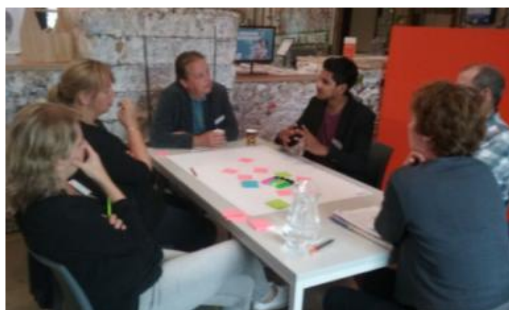
Figure 2: A ESIW pre-event #1 breakout group

In line with the workshop format, participants divided themselves into six breakout groups of four to seven participants each. They were asked to join as much as possible groups consisting of people whom they did not know yet, to increase the chance of unexpected cross-overs emerging. The groups were tasked with looking for thematic and event cross-overs in a free-form group discussion. As a discussion aid, each group received an empty poster sheet and stacks of post-it notes in three different colors: pink post-its represented organizations/initiatives/activities participating or to participate in ESIW, blue post-its denoted possible thematic/event cross-overs and green post-its listed tags capturing ideas about how these cross-overs might be designed.