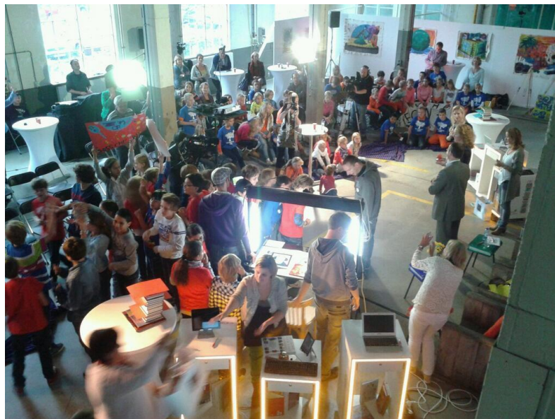
Figure 4 Successful launch of the B@ttlewetters Kids’ Knowledge Battle

Note that Table 1 only outlined the sensemaking steps taken in the first two stages of the SIS method, as working out the details of the subsequent prototype implementation was considered to be outside the scope of the joint sensemaking activities. Instead, the actual development of the prototype took place in regular project management processes of the participating library and university organizations.