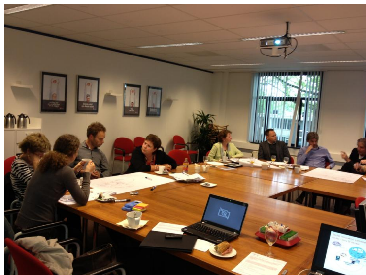
Figure 3: Group Discussions during Workshop 2: Inter-sectoral sensemaking

The main purpose of this paper is to frame the need and outline a practical method for inter-sectoral social innovation sensemaking with public libraries. Space is lacking here to discuss in detail how the SIS-method was implemented in this inter-sectoral sensemaking exercise between public libraries and universities. The reader is referred to Appendices 1 and 2 for a summary. In all, the method was applied successfully in stages 1-3 (Prompts, Proposals, and Prototypes) of the Social Innovation Process model, going from intra-sectoral sensemaking in Workshop 1 to inter-sectoral sensemaking in Workshop 2 (Fig. 3), and the subsequent implementation of the ideas in a first prototype.